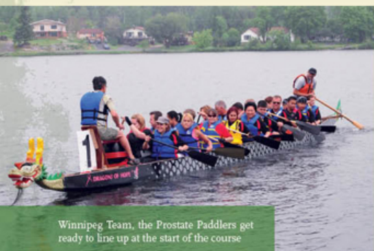
Winnipeg Team, the Prostate Paddlers get ready to line up at the start of the course