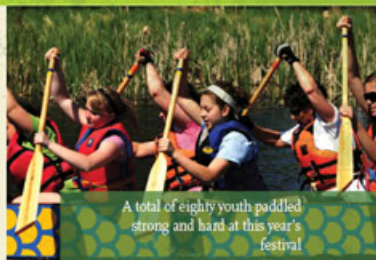
A total of eighty youth paddled strong and hard at this year's festival

In the tightest finish in event history, Kenora Team Super Troopers took the A Division in 2:04.71 ahead of Winnipeg's Acra Knight's time of 2:05.16. Copperfin Credit Union came in third with a time of 2:12.18, while Dragon Tamers were fourth with 2:44.67. "Aeolian Ark" from Winnipeg, took first place in the ladies division, while "Ski and Row" placed first in the youth division. A big thank you to all our sponsors for their wonderful support in making this a fundraiser a success.